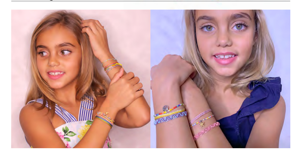
KIDS WEB 01